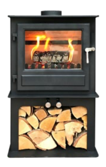
Black & Stainless Steel Log Box Option